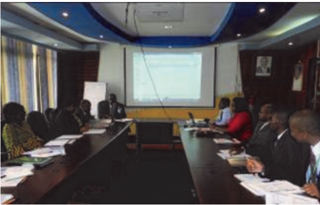
PPA Ghana officials listening to a presentation