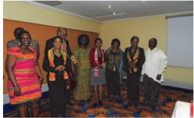
PPA Ghana officials with some Directors of the PPADB at a farewell cocktail organized in their honour.