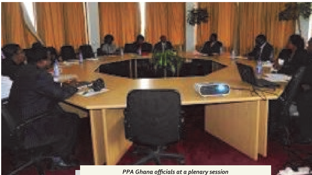
PPA Ghana officials at a plenary session

Major observations and critical issues identified from the tour which are worth considering for possible adoption to promote greater effectiveness and efficiency in Ghana's public procurement management system are summarized in the table below: