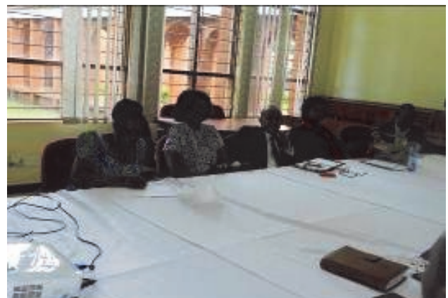
PPA Ghana officials attending a presentation at the offices of the PPAD, Malawi.