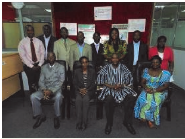
Ghana's PPA & Tanzania's PPRA officials in a group photograph

◆ Tender and Contract Information — Page 10