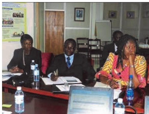
PPA Ghana officials listening to a presentation