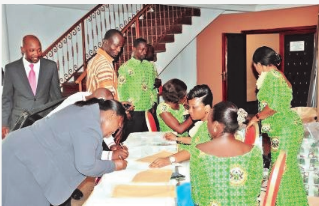
At the Registration Desk