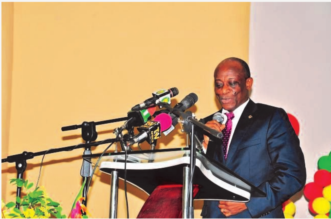
Minister of Finance—Mr. Seth Tekper giving his key-note address